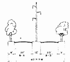
TYPE D SECONDARY THOROUGHFARE