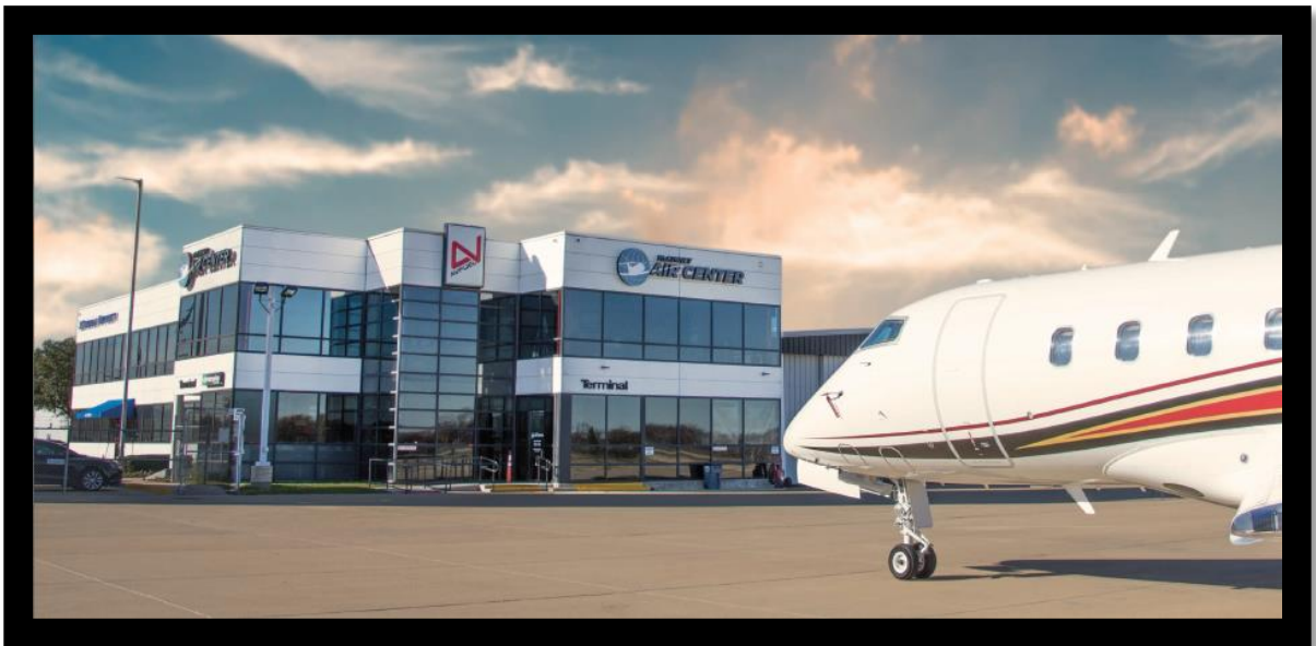
Airport TIRZ (McKinney National Airport)

The purpose of TIRZ No.2, also known as the Airport TIRZ, is to provide the infrastructure support necessary to fulfill the aforesaid mission of the airport.