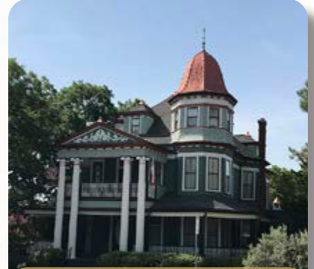
Historic Town Center Residential