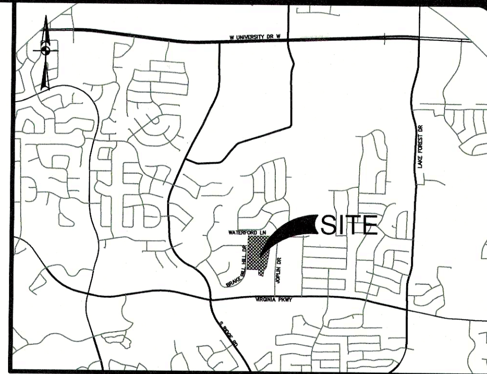
LOCATION MAP NOT-TO-SCALE CITY OF MCKINNEY COLLIN COUNTY