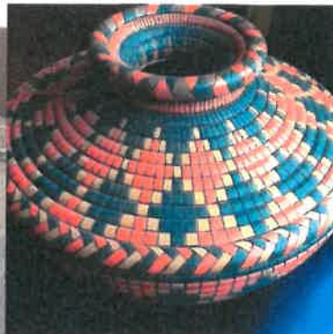
FRESH LOOK: Woodworking