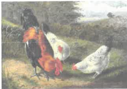
Art History Brown Bags