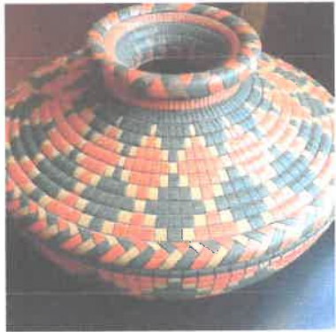
FRESH LOOK: Woodworking Extravaganza