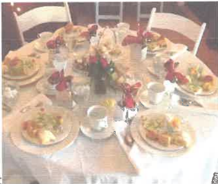
Holiday Tea & Conversation