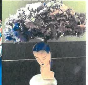
Forever Stylish Exhibit