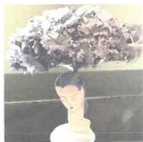
Forever Stylish Exhibit