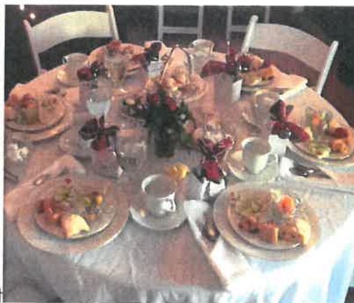
Holiday Tea & Conversation