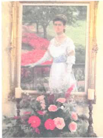
Art Meets Floral