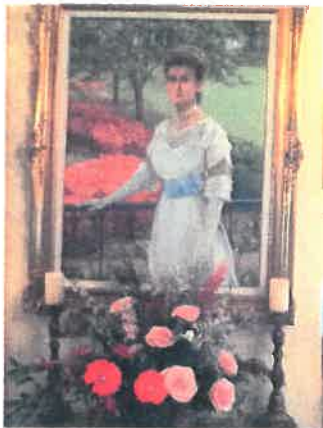
Art Meets Floral