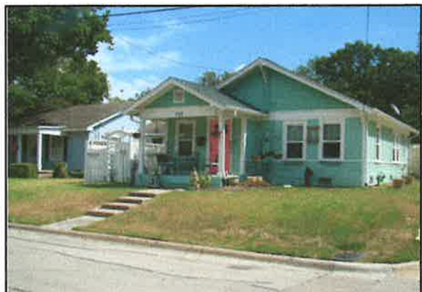
208 N. Bradley Street