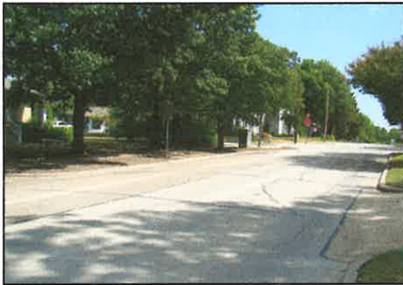
View looking West on W. Virginia Street