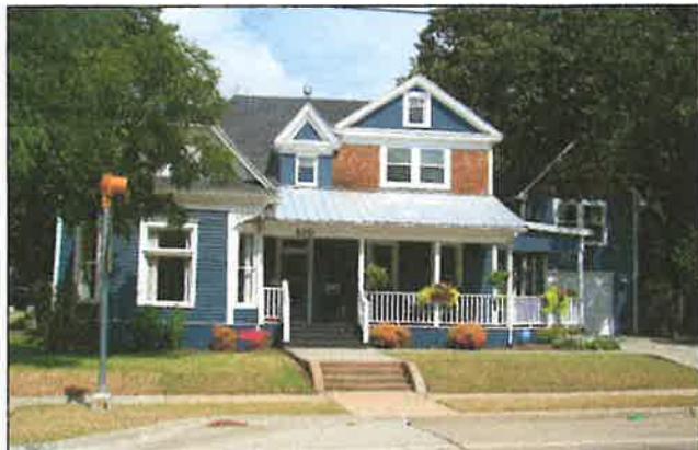
620 W. Virginia