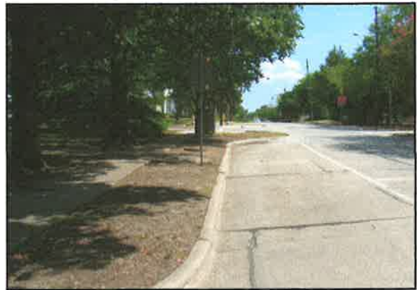
View looking East on W. Virginia Street