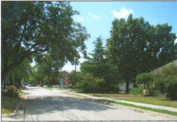
View looking South on N Bradley Street