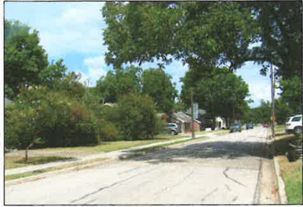
View looking North on N Bradley Street