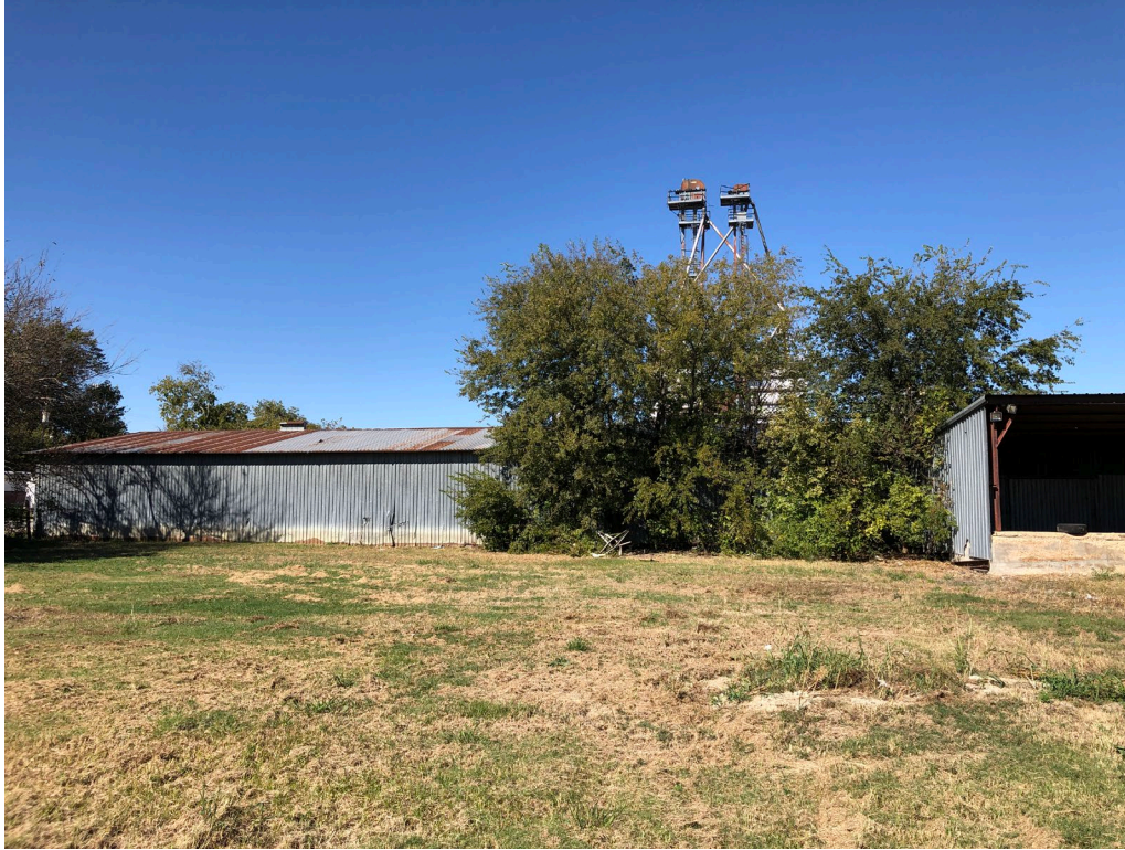
Photo of Barrel Aging Building