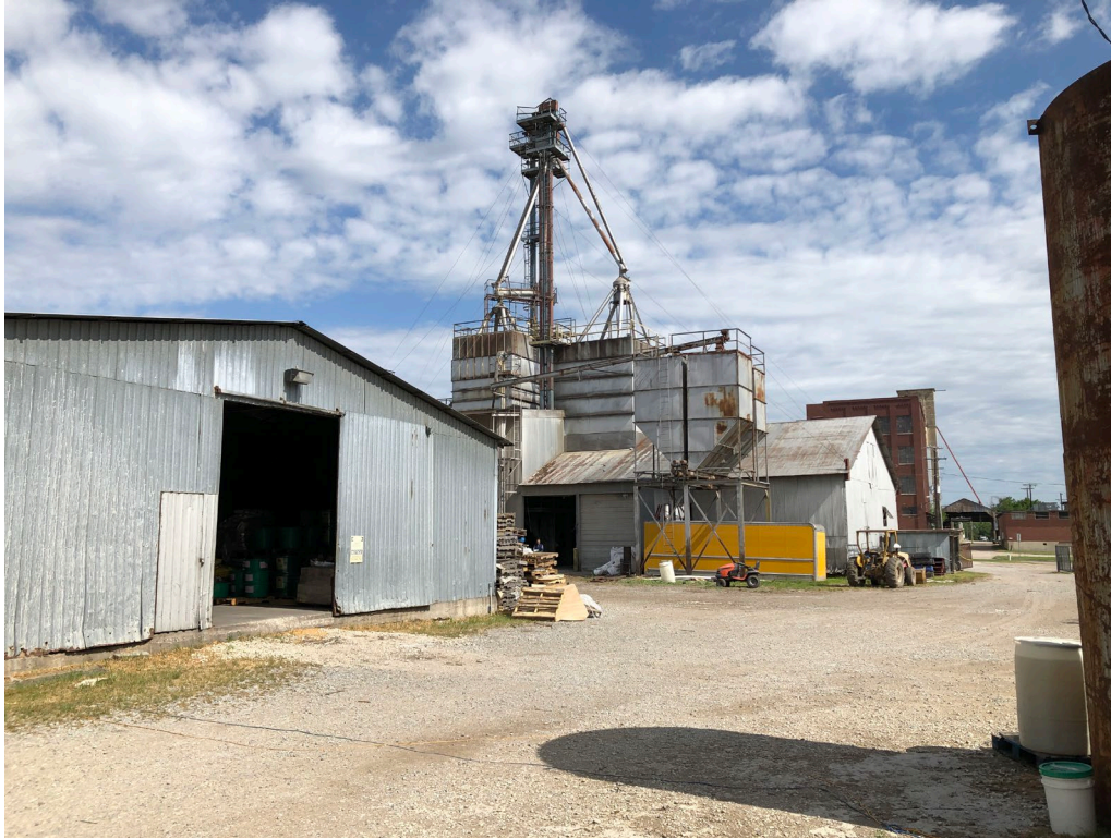
Photo of Existing Shed