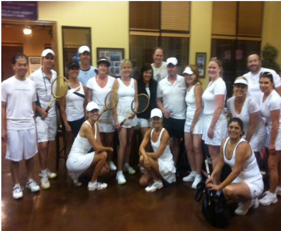
Wimbledon Social Night