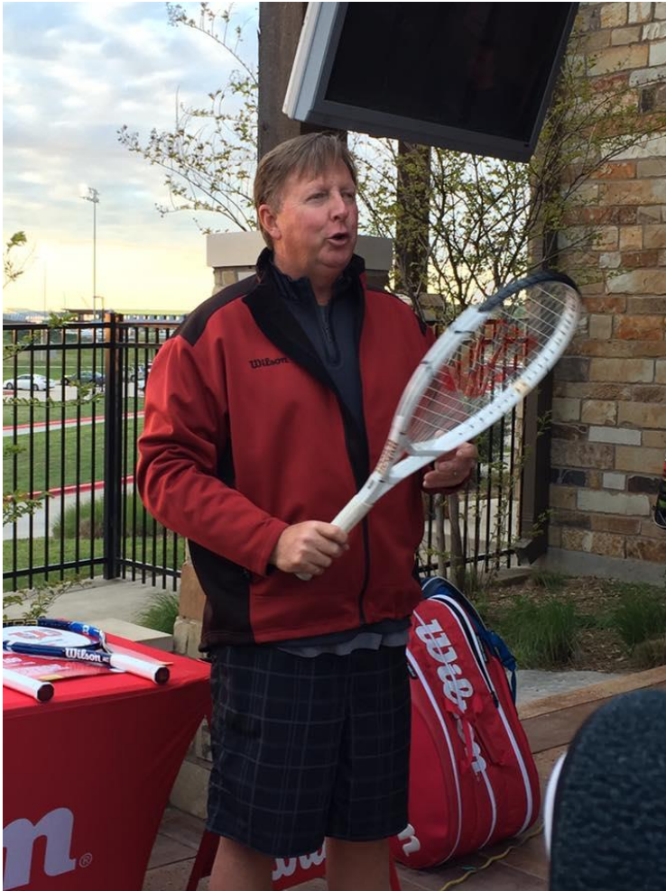
Wilson Demo Mixer