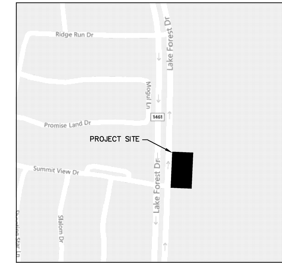
VICINITY MAP NTS