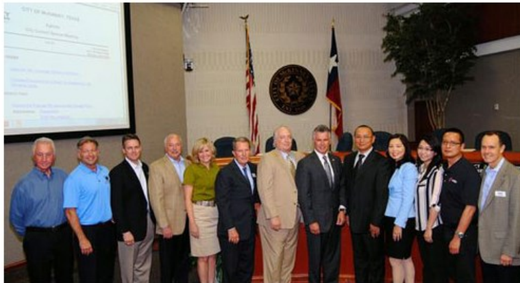
McKinney mayor, city council and board welcome Hisun Motors Corp. to McKinney at special council session

McKinney, Texas (May 1, 2014) – McKinney City officials welcomed the U.S. President of China-based Hisun Motors Corporation, a leading maker of utility-terrain vehicles and all-terrain vehicles, at a special council work session on Monday, April 28. Hisun Motors Corp. USA selected McKinney, Texas as the new site for the company's North American headquarters.