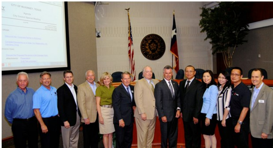
McKinney Mayor, City Council and Board welcome Hisun Motors Corp. to McKinney at special council session