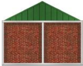
Buildings # 5, 7, 9 & 11 East / West Elevation 100% Masonry (less Downspouts)