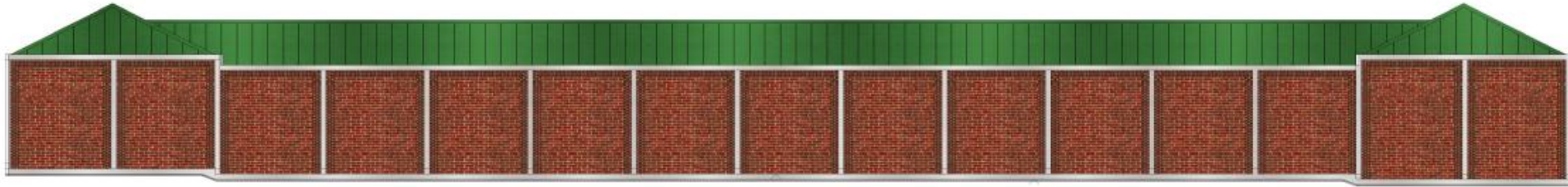
Buildings # 5, 7, 9 & 11 North Elevation 100% Masonry (less Downspouts)