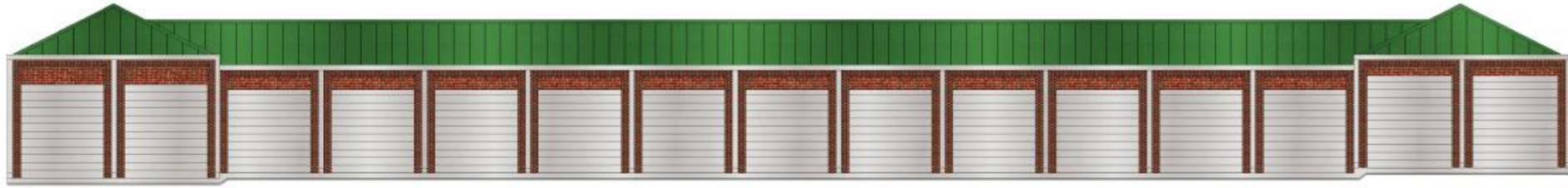
Buildings # 5, 7, 9 & 11 South Elevation 100% Masonry (less Doors and Downspouts)