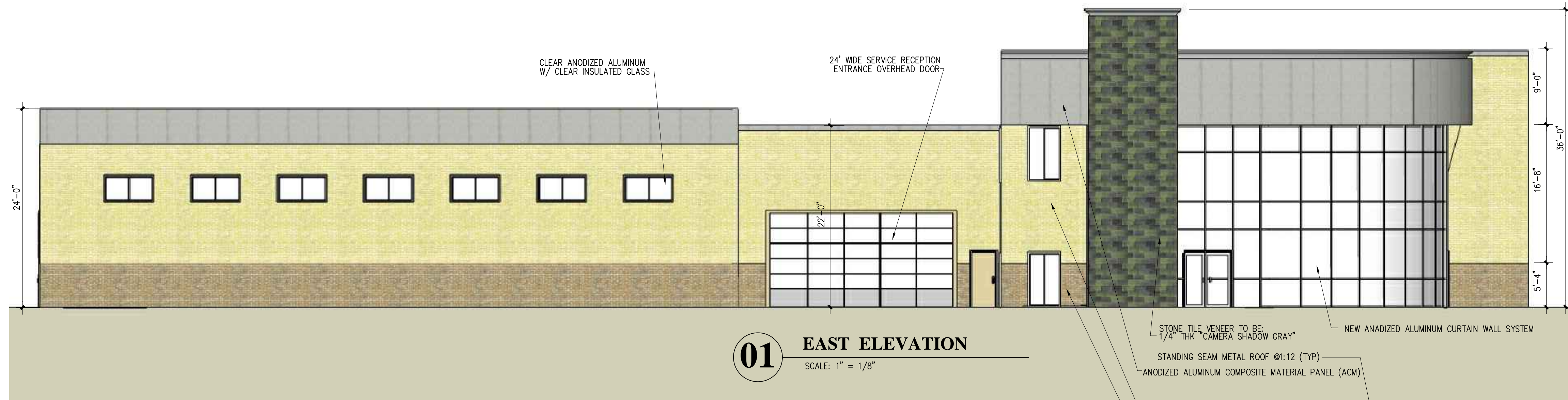
01 EAST ELEVATION SCALE: 1" = 1/8"