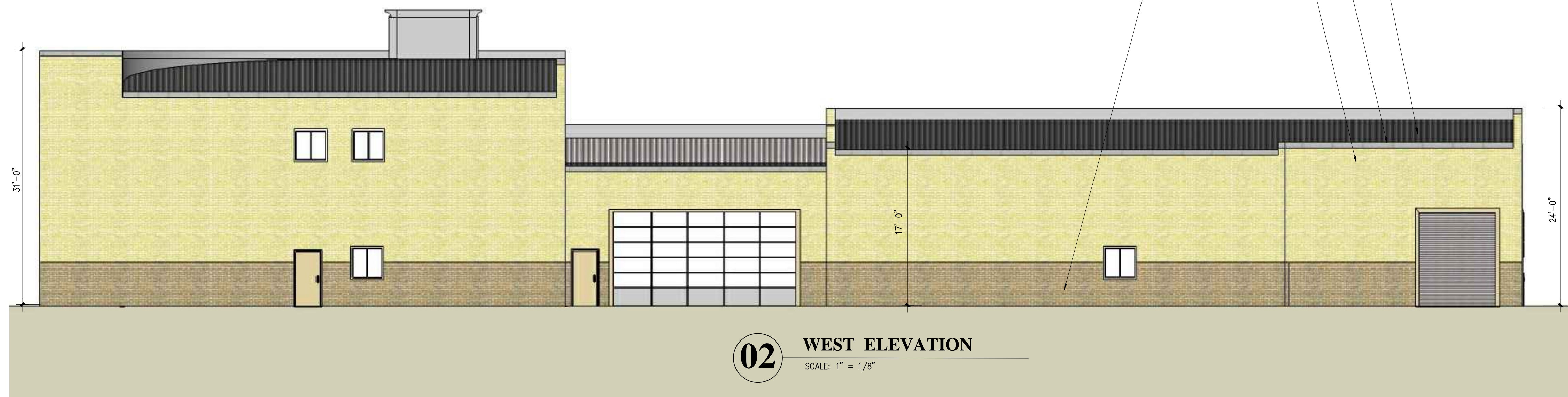
02 WEST ELEVATION SCALE: 1" = 1/8"