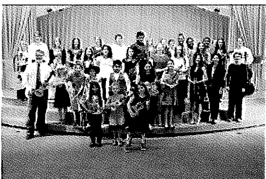
Performers (faculty and students) at each concert.