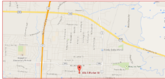
2 VICINITY / LOCATION MAP NO SCALE