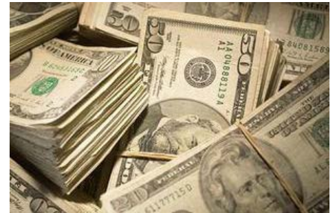
What are the most charitable ZIP codes in North Texas?

And take a look below at Esri's digital interactive map to see where your ZIP stacks up in charitable contributions.