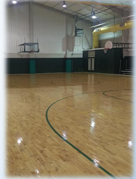
OLD SETTLER'S RECREATION CENTER