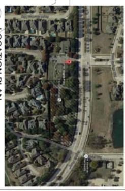
2 LOCATION PLAN SCALE: N.T.S.