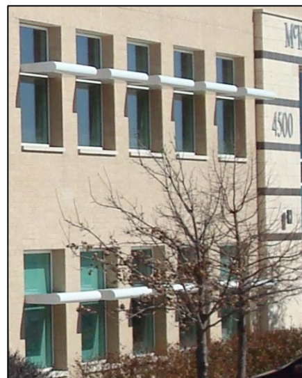
IMAGES 4, 5, 6 & 7. Examples of Appropriate Fenestration.