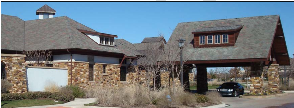
IMAGES 11, 12 & 13. Examples of Appropriate Entry Treatments.