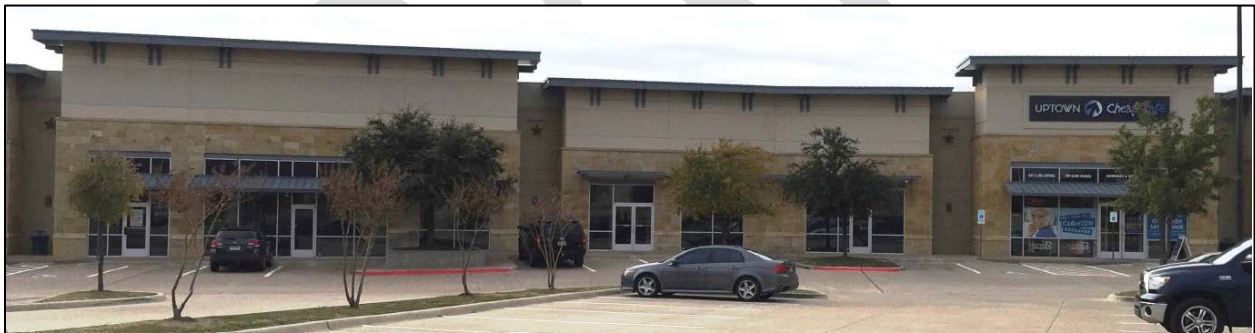
IMAGES 14, 15 16 & 17. Examples of Tripartite Design.