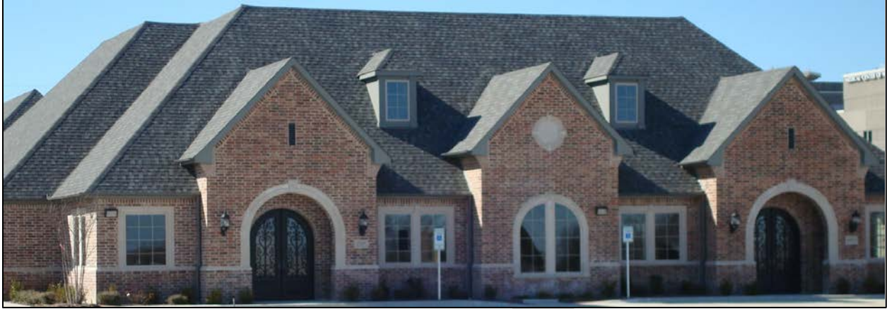
IMAGES 8, 9 & 10. Examples of Appropriate Roof Treatments.