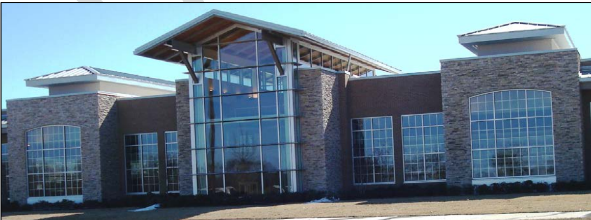
IMAGES 1, 2 & 3. Examples of Appropriate Building Massing.