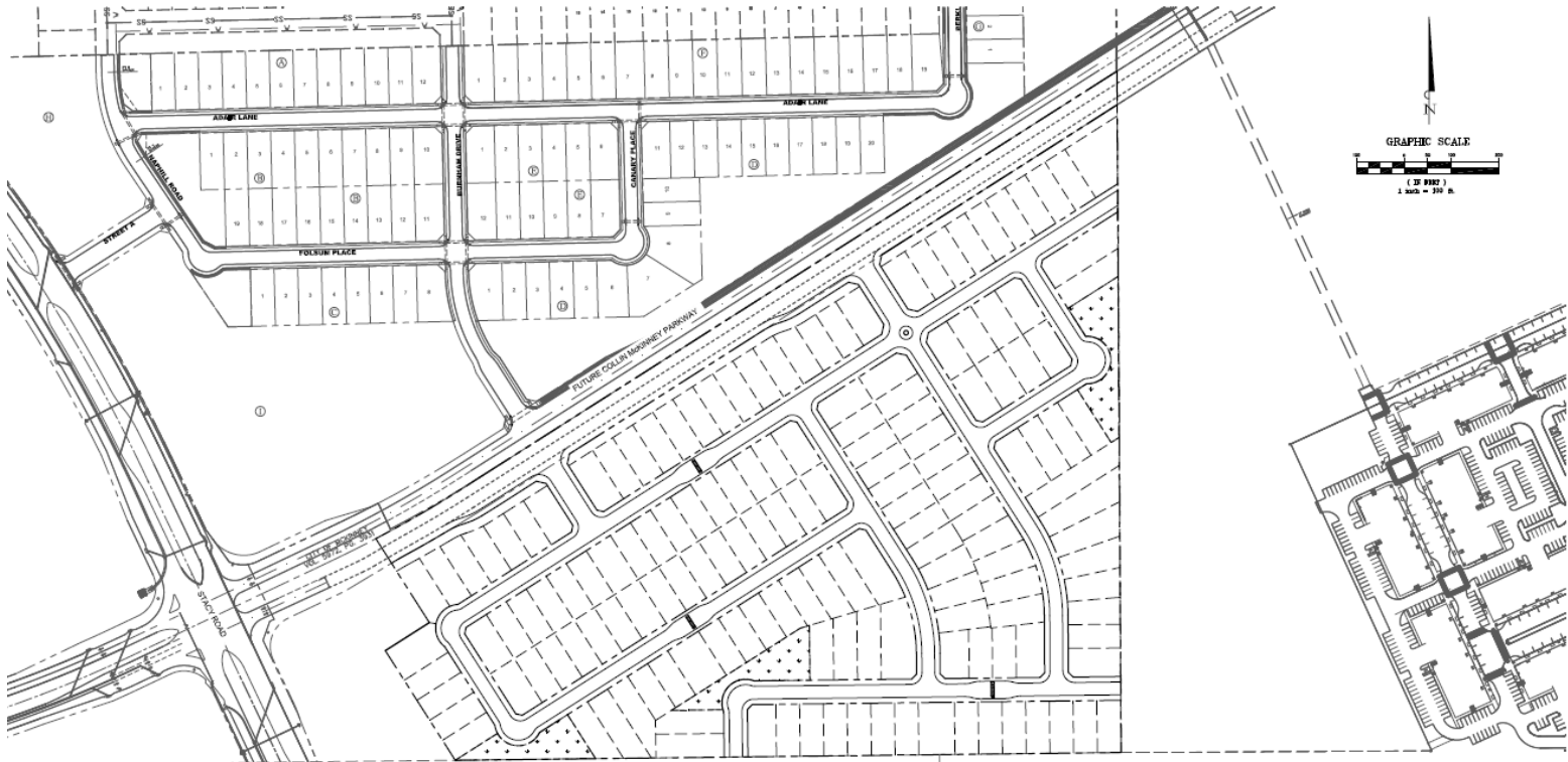
LAND PLAN 33.26 ACRE SEC STACY ROAD AND FUTURE COLLIN MCKINNEY PARKWAY 152 SF DETACHED LOTS (50' x 110')