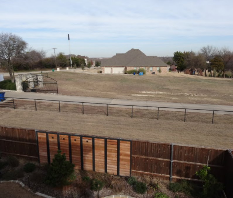
Current actual view to north from balcony 2804 Albany Drive