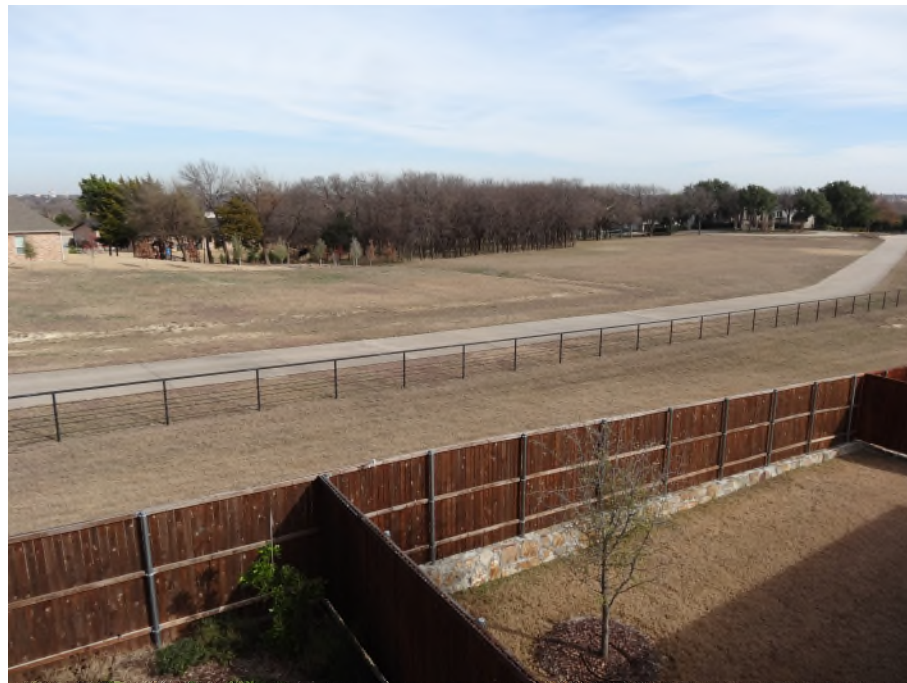
Current actual view to northeast from balcony 2804 Albany Drive