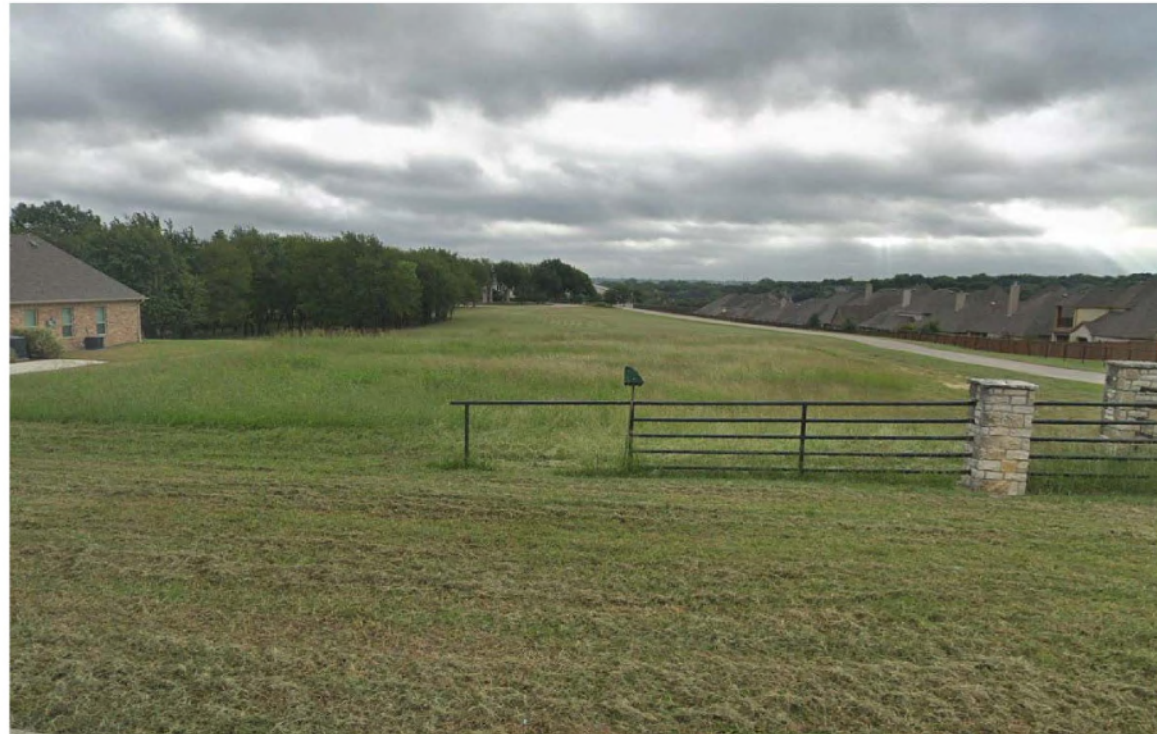
Looking East from Sorrell Road