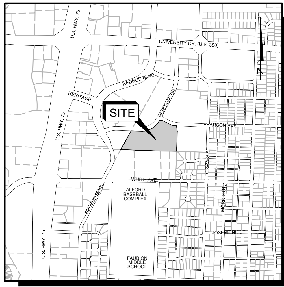
LOCATION MAP SCALE: NTS

SITE DATA EX. ZONING: PD 1463 EX. LAND USE: OFFICE