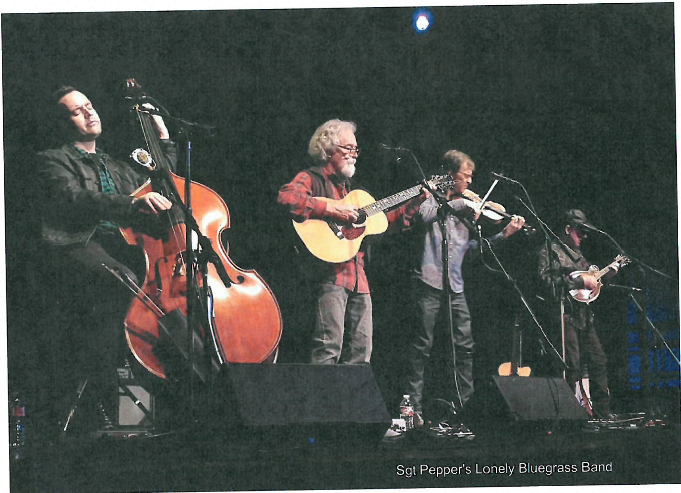
Sgt Pepper's Lonely Bluegrass Band