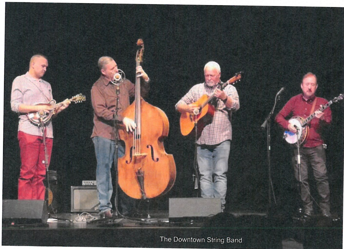
The Downtown String Band