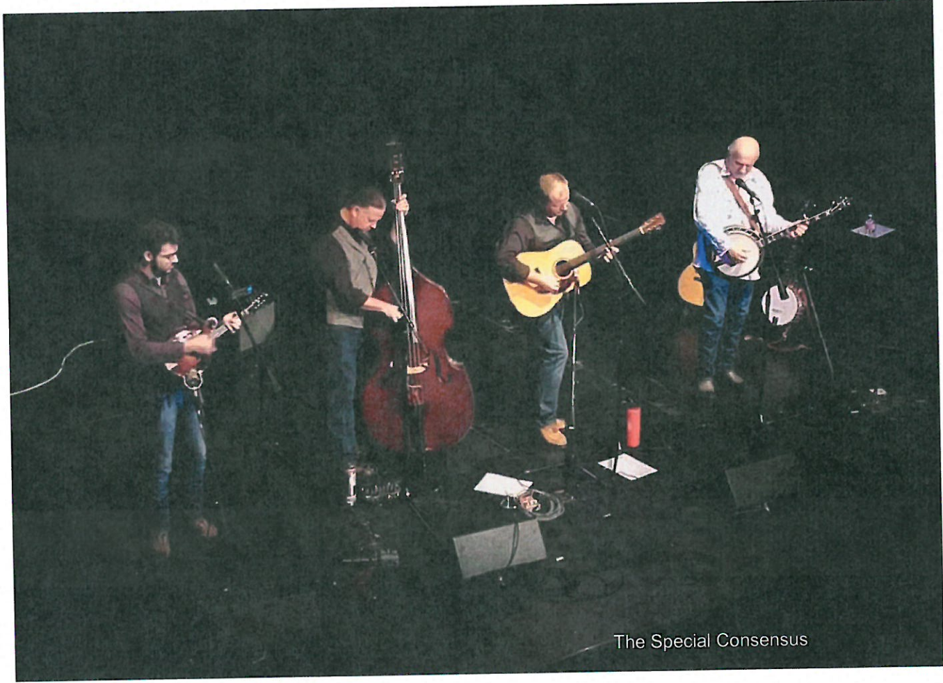
The Special Consensus