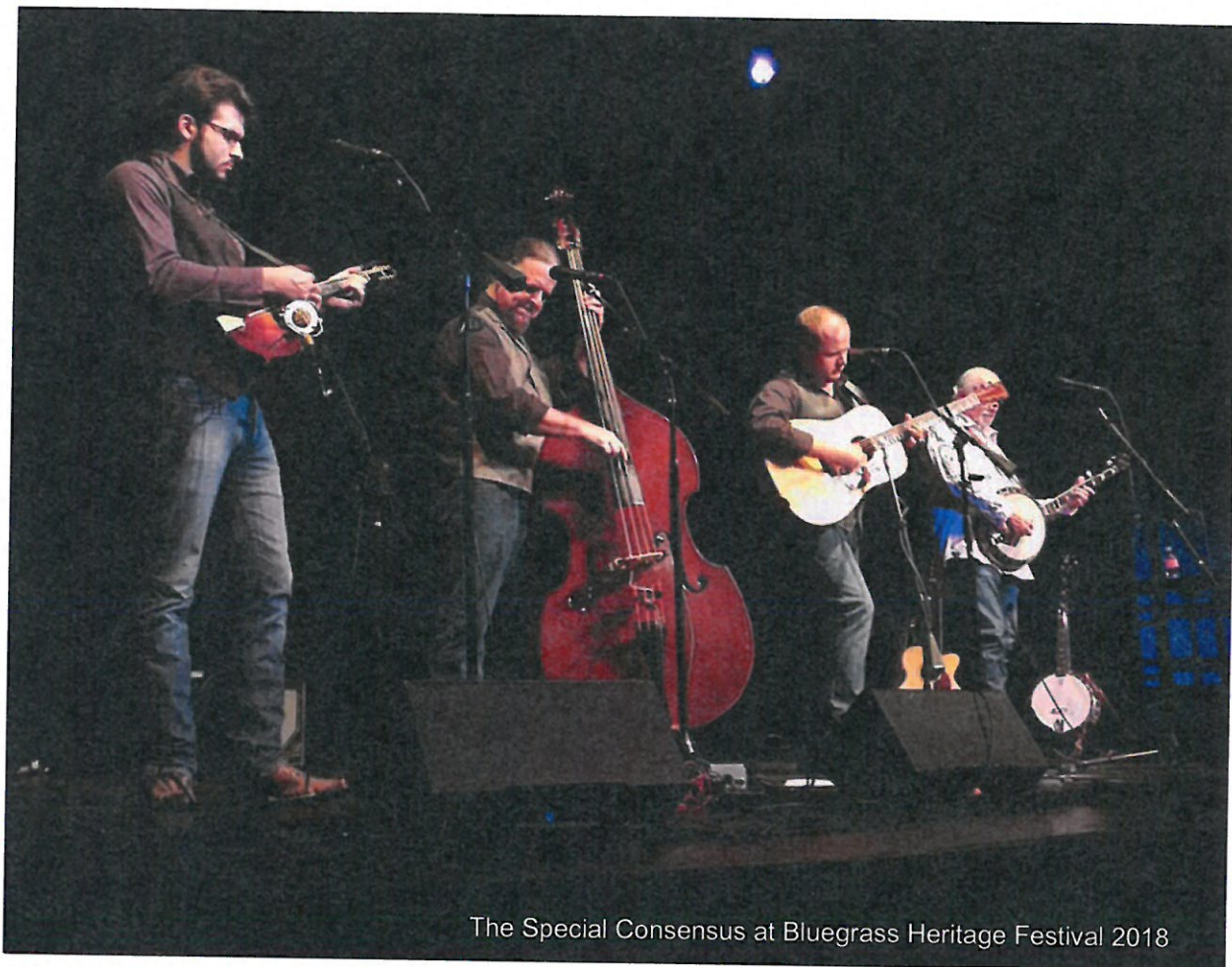
The Special Consensus at Bluegrass Heritage Festival 2018