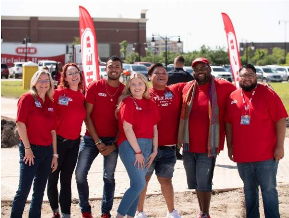
H-E-B announces plans to open DFW Metroplex store in McKinney