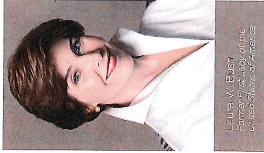
Laura W. Bush Former First Lady of the United States of America

Mrs. Laura Bush is actively involved in issues of national and global concern, with a particular emphasis on education, health care and human rights.