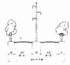
TYPE D SECONDARY THOROUGHFARE