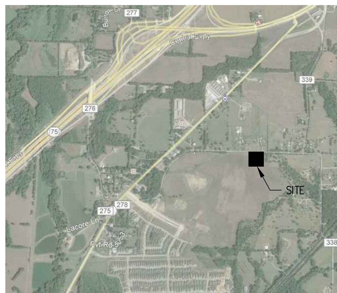
01 VICINITY MAP N.T.S.