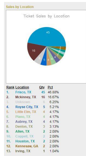
Peter and the Wolf