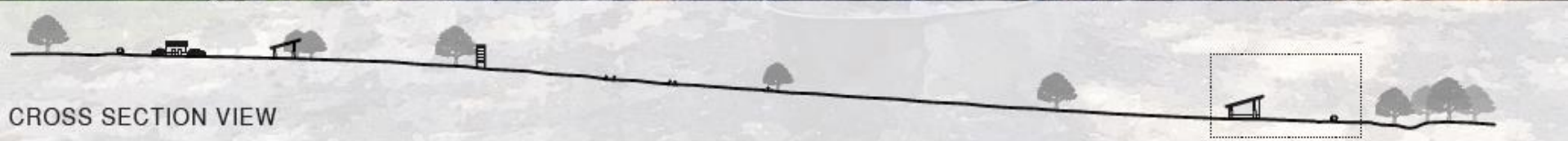
CROSS SECTION VIEW