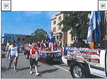
The McKinney VFW Post 2150 took the First Place cash award for its float in the 2012 Red White and Boom Hometown Parade in downtown McKinney.