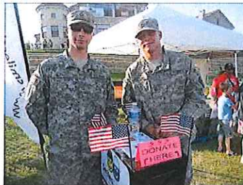
Two Soldiers man a donation station at McKinney's Smiles Concert in 2011.

Named by Money Magazine as the #2 Best Place to Live in America in 2012, McKinney also made the magazine's biannual list at #14 in 2008 and the #5 spot in 2010, largely because of the quality of life provided to its residents. The rapidly-growing city of 141,000 features rich Texas heritage, miles of hike and bike trails, beautiful scenic areas, parks, and oodles of cultural offerings. McKinney specifically shines as a welcoming place for military personnel with programs in place to help veterans and their families.