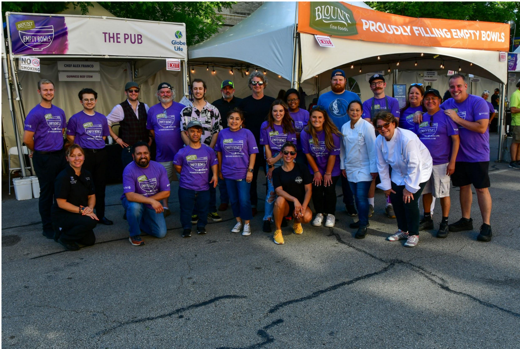
Our amazing vendors!