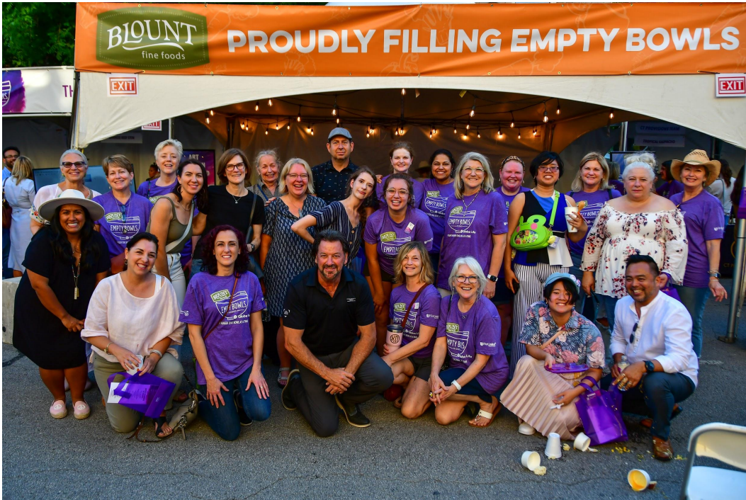
Our phenomenal artists!