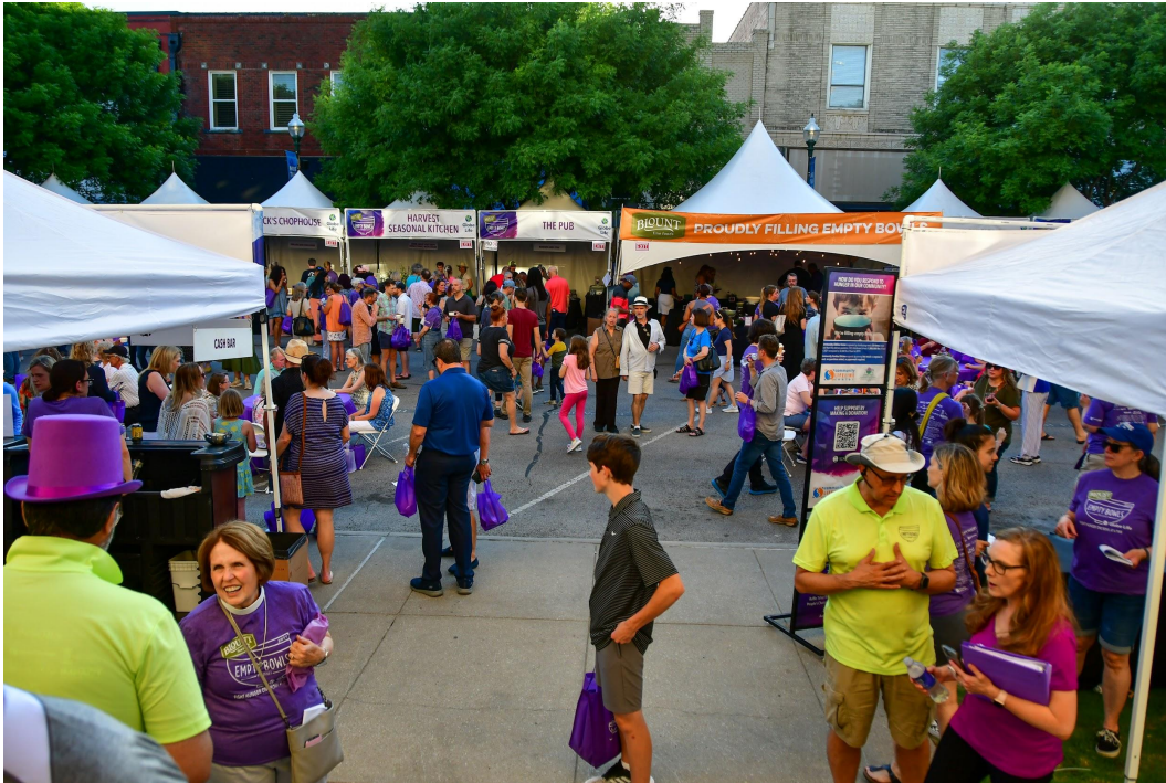
People on Kentucky Street enjoying the event.