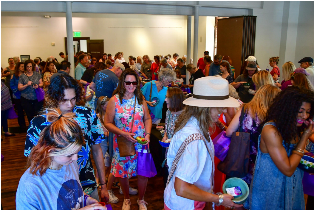
Inside the busy bowl room!