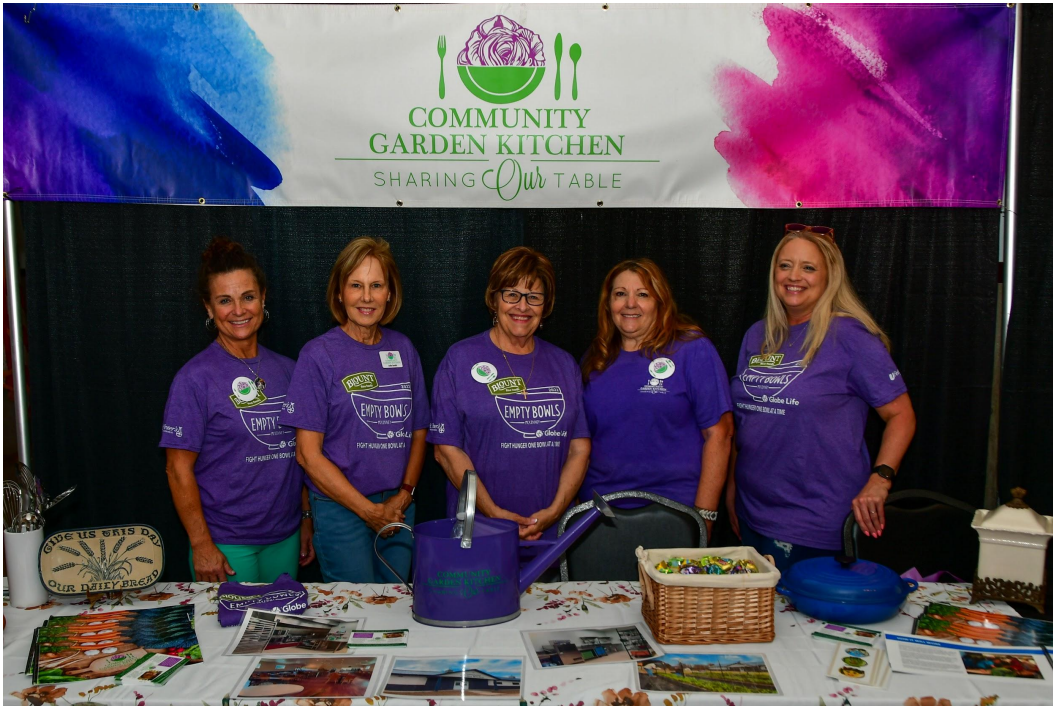
Community Garden Kitchen