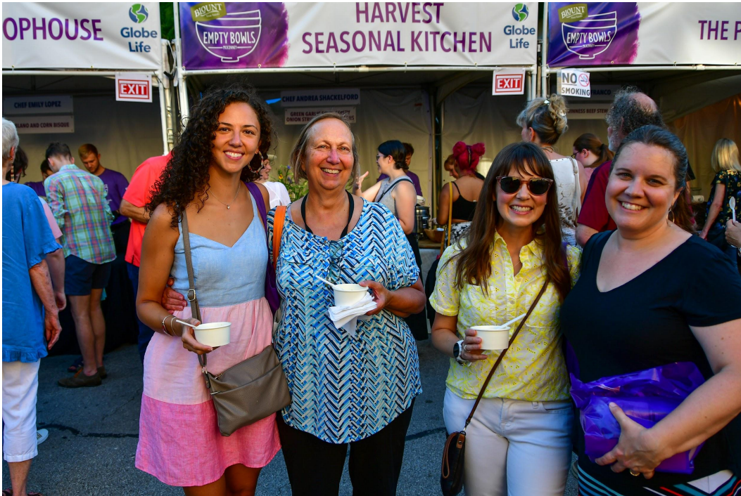
Happy soup samplers!