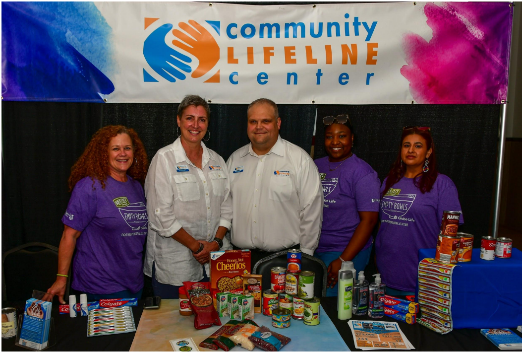
Community Lifeline Center