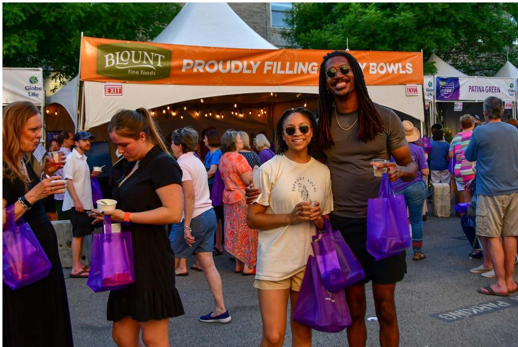
Guests with event bowls, merchandise, soups, and beverages!