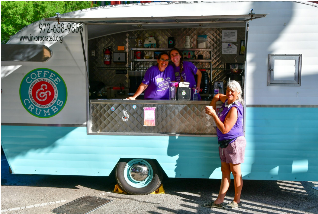
One of our new vendors, Coffee & Crumbs, provided fun drink options like cactus pear lemonade, cold brew, and iced tea!