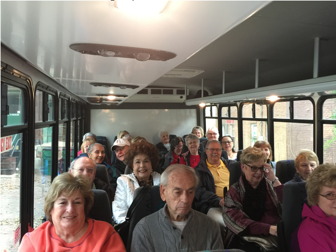
This is one of the tour groups from North Dallas Bank in Dallas.