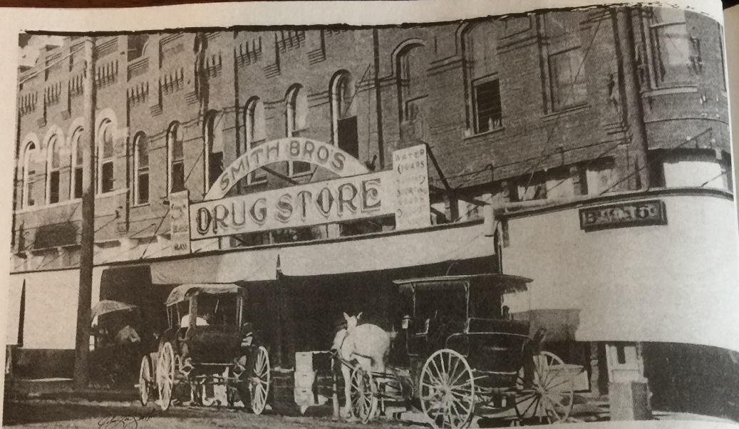
Smith Drug Store was established in 1881

This is one of the ads in Historic Downtown McKinney Sketched which promotes the museum and other downtown businesses.