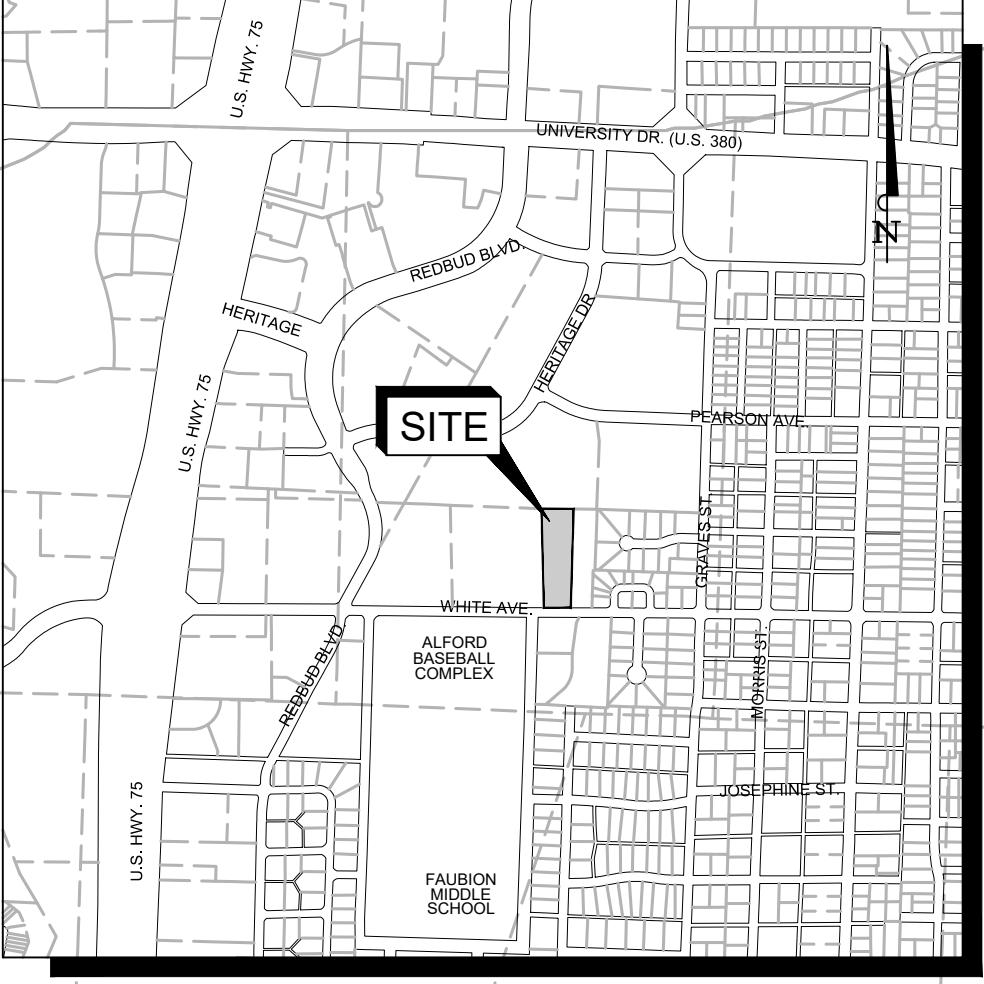
LOCATION MAP SCALE: NTS