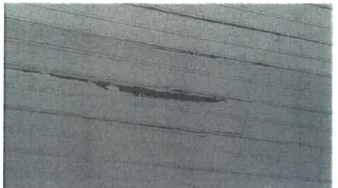
Ceiling damage from faulty roof