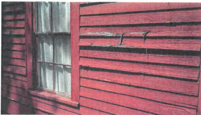
Peeling exterior paint