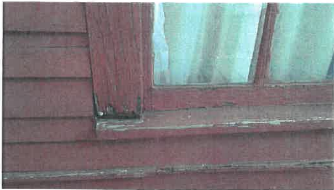
Taylor Inn Window