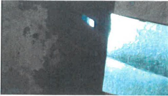
Hole in roof/attic ceiling