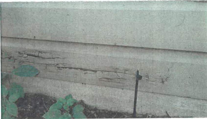
Damage to Visitors Center caused by above ground sprinkler heads in flower beds