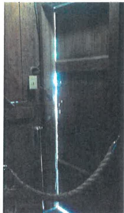
Ill fitting door