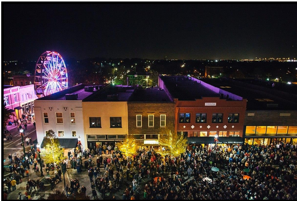
Town Center TIRZ 1 (Historic Downtown McKinney)

The adopted Town Center Study calls for the preservation of the Historic Core with enhancements for an eventual Transit Village around the proposed rail transit station.