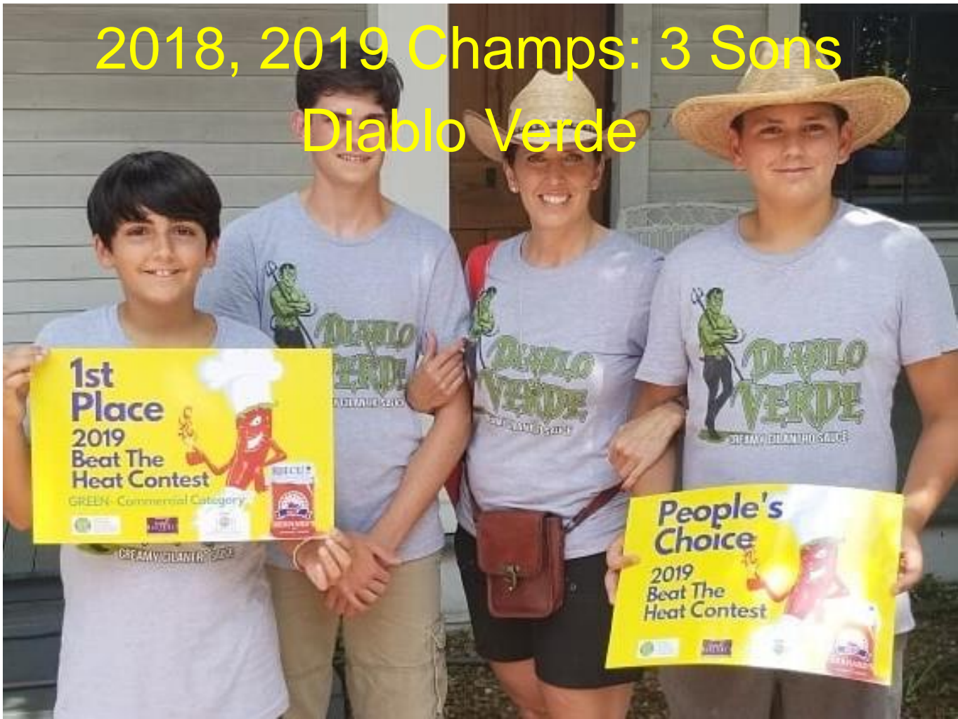
2018, 2019 Champs: 3 Sons Diablo Verde