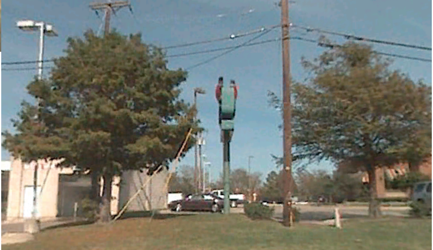
Signs surrounded by tree's and building