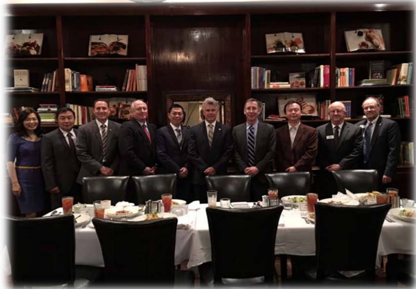
Brilong Welcome Luncheon Esteemed Attendees