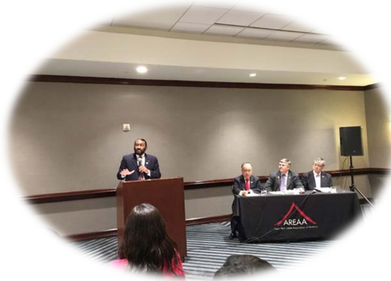
Speaker: Congressman Al Green-US House of Representatives