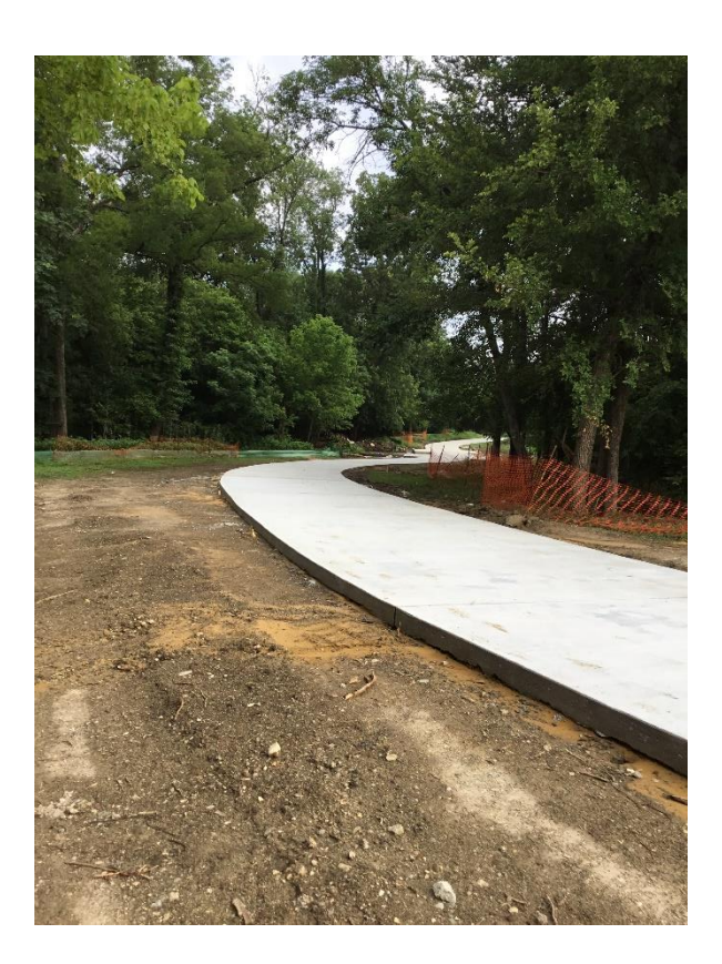
Looking towards softball complex