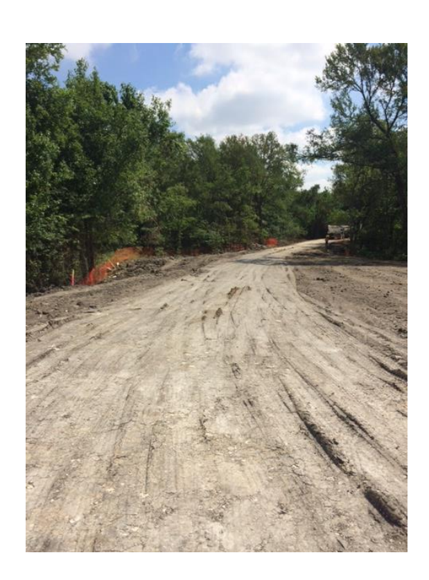
Standing on Hardin Blvd. looking onto the park road