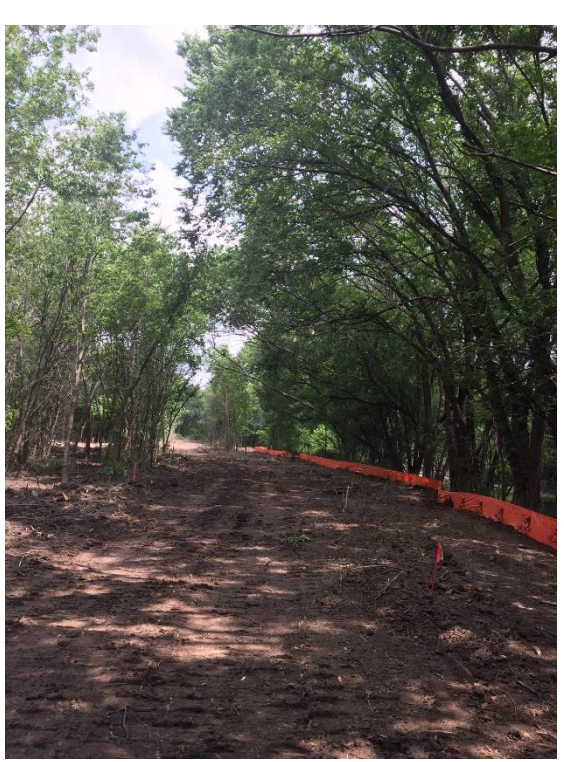
Road layout through the trees