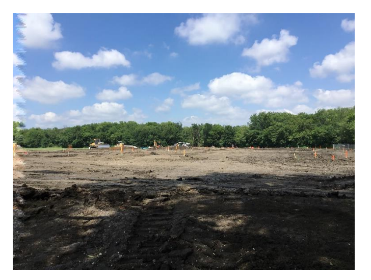
Parking lot layout