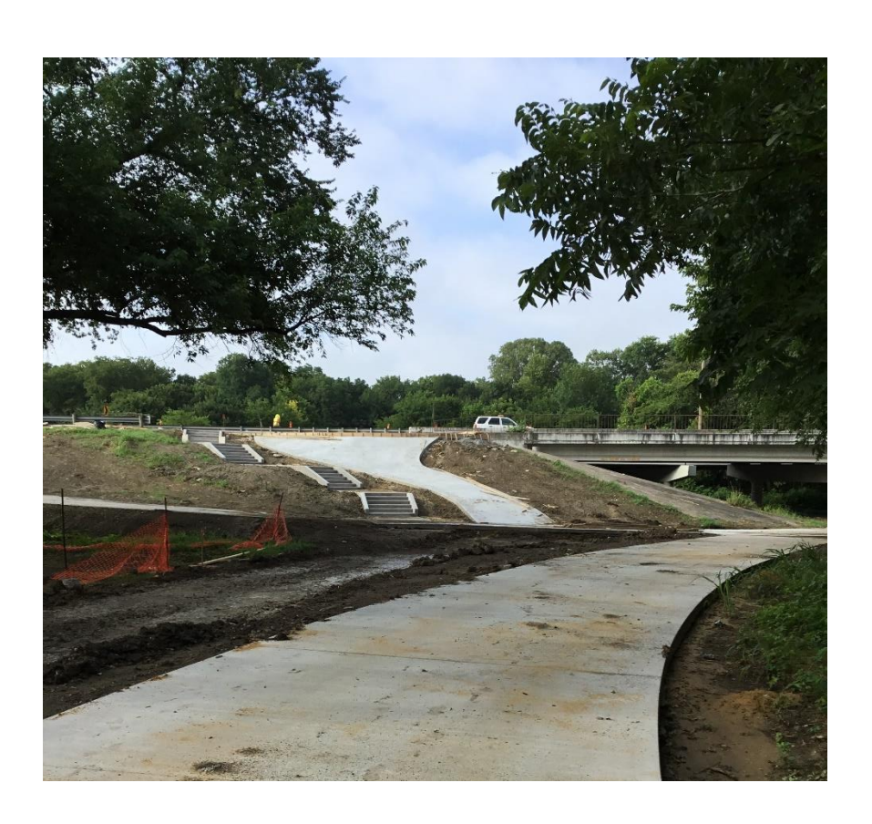
Looking towards Eldorado Parkway