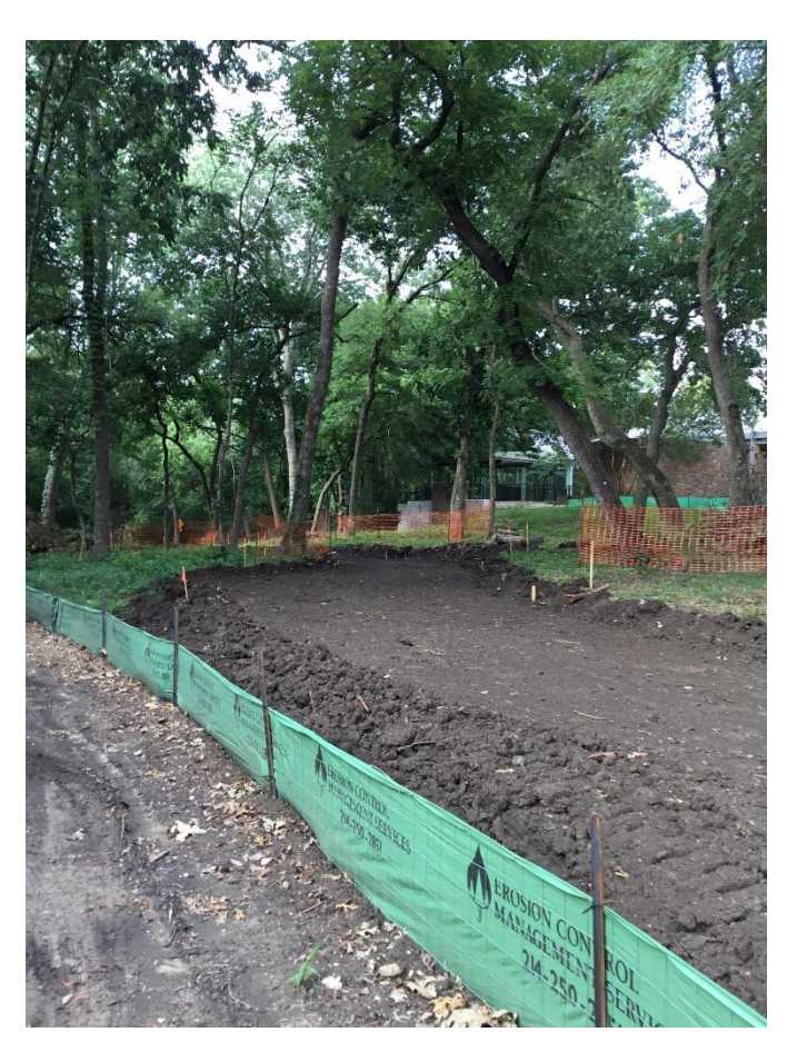
Trail layout near Community Center