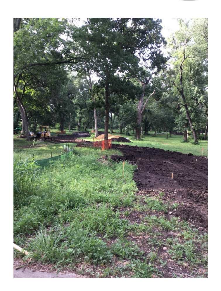
Trail layout looking towards Comegys Creek