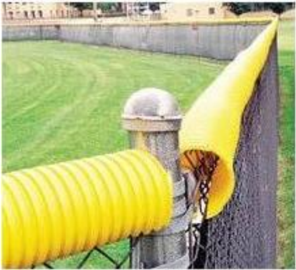
Yellow Top Rails