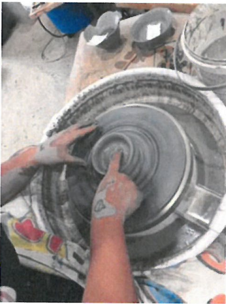
Love and Light Magda Dia www.jumpintoart.com