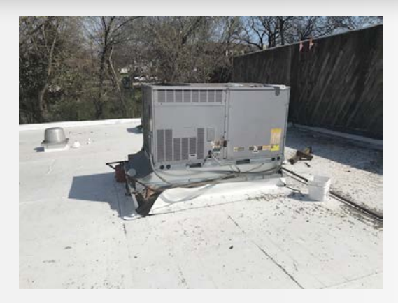
Request for Roof Repair Assistance $40,000