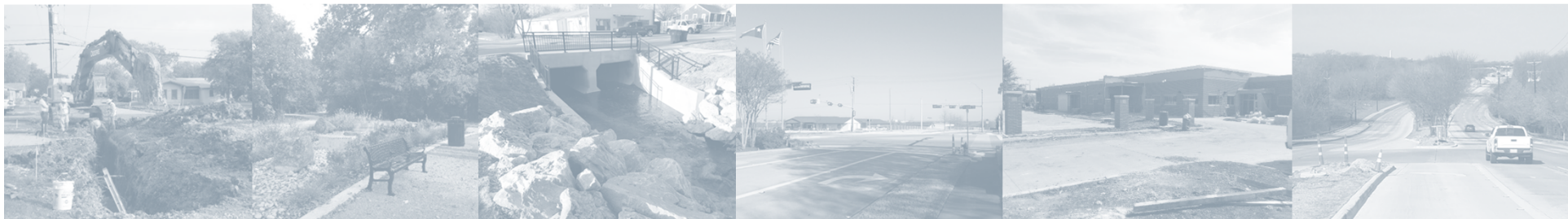
CITY OF MCKINNEY CAPITAL IMPROVEMENTS