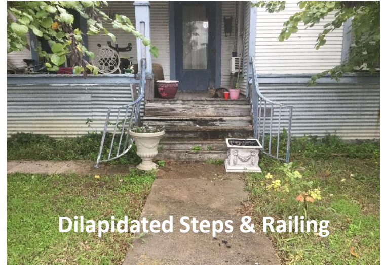
Dilapidated Steps & Railing