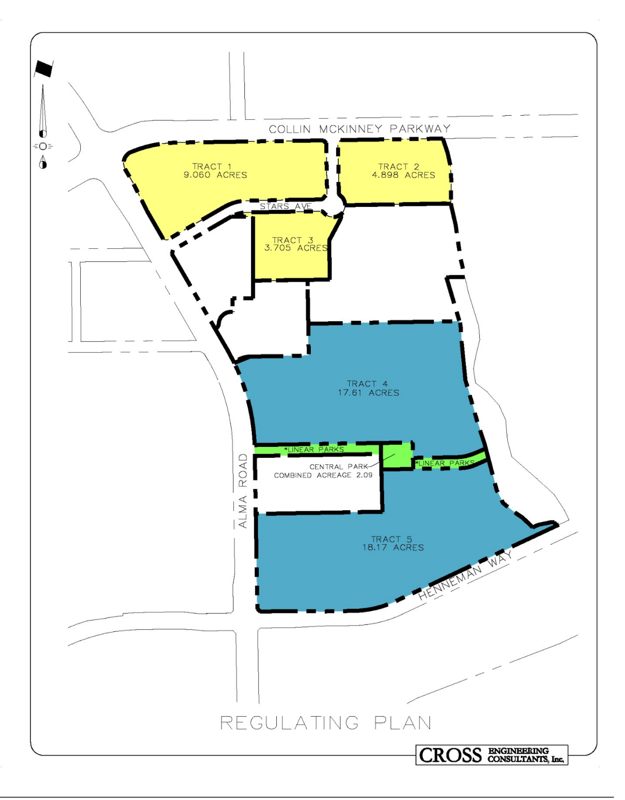
Exhibit 1 – Development Regulations VCIM – The Ballfields Zoning 2335038_19