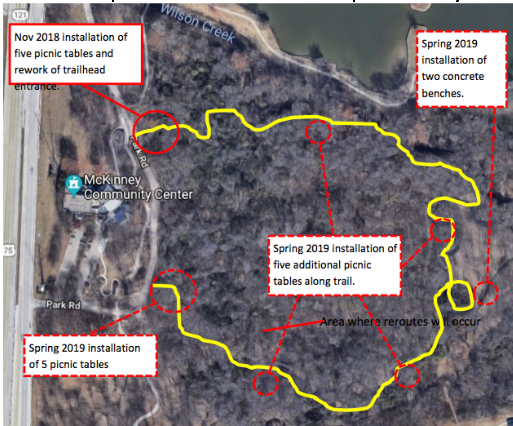
Community Center Trail Map and Proposed Locations for new Tables and Benches