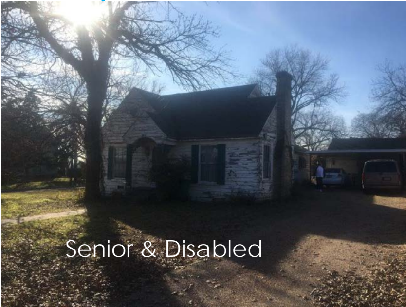
Senior & Disabled