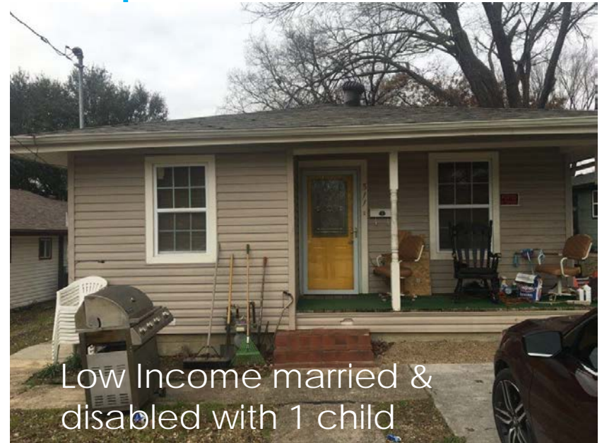
Low Income married & disabled with 1 child