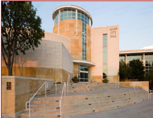
City of Allen's City Hall

$50 million for a municipal community complex