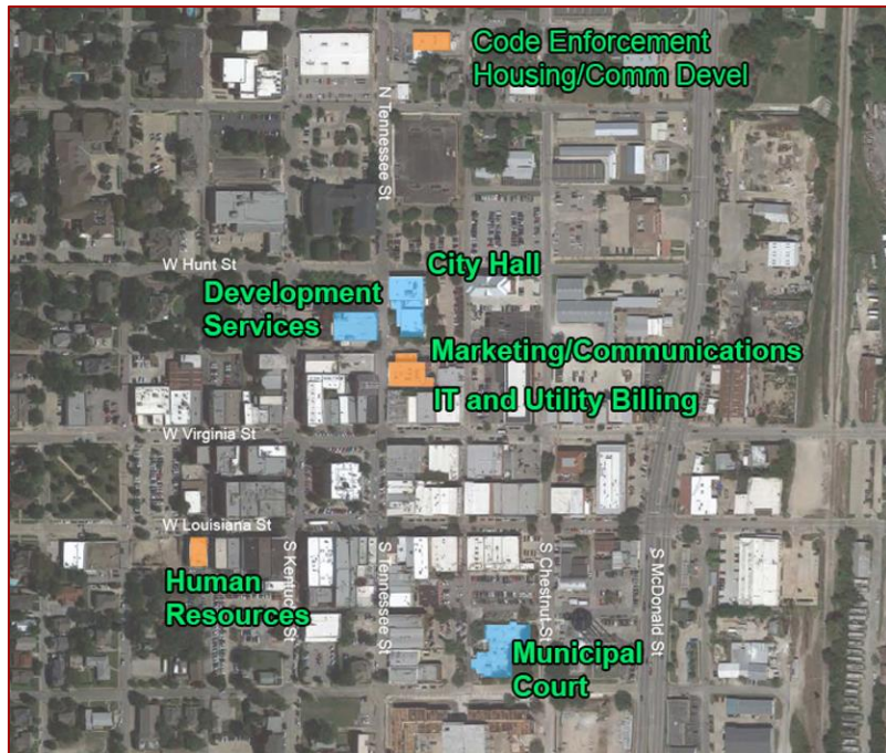
Core City Services Locations

Design and construct a complex for core city services and public and community spaces