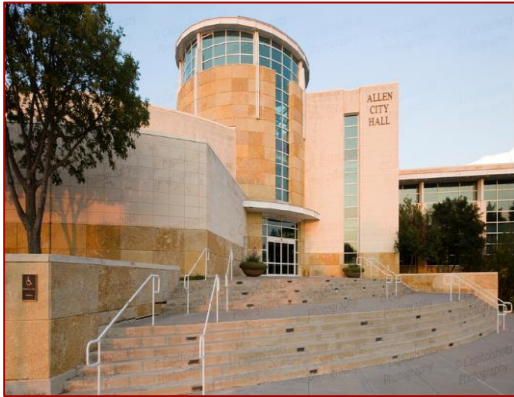
City of Allen's City Hall

$50 million for a municipal community complex