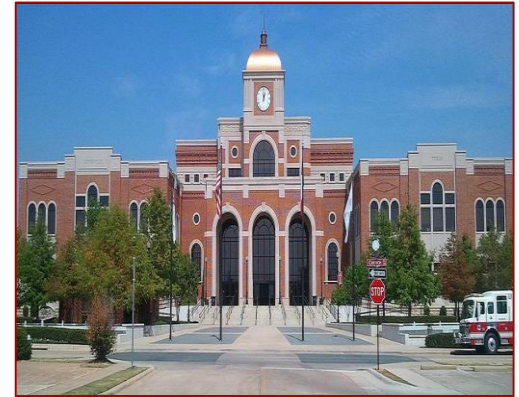
City of Lewisville's City Hall