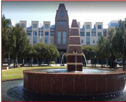
City of Frisco's City Hall