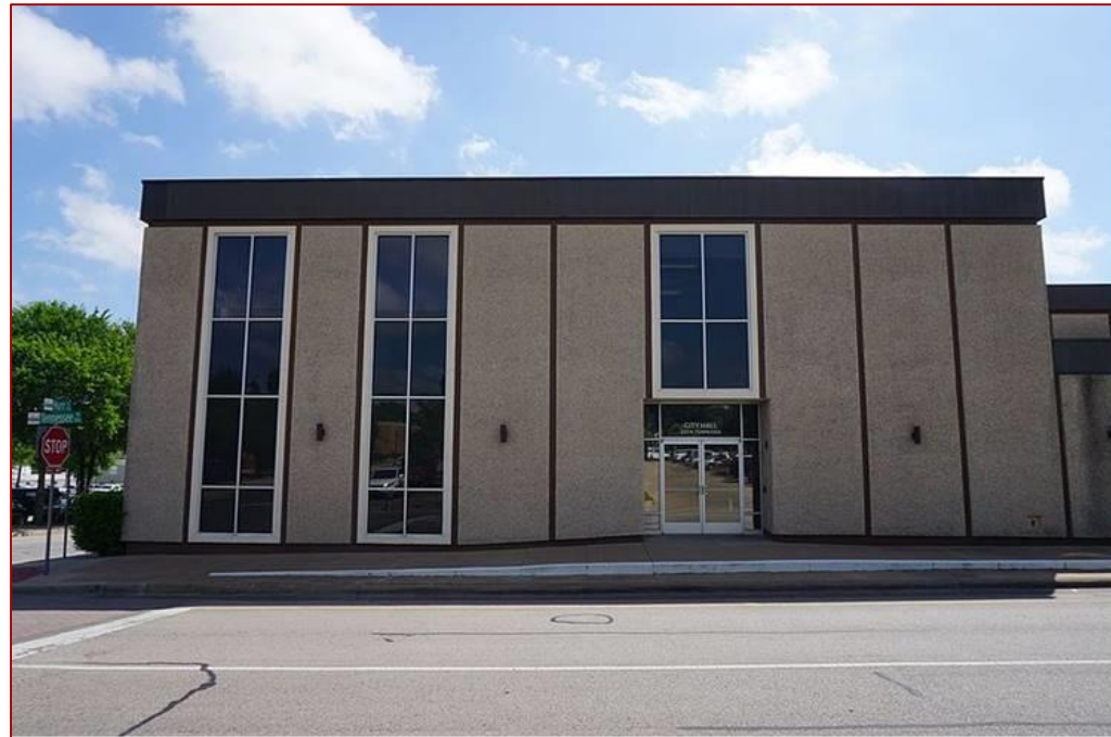
City of McKinney's City Hall