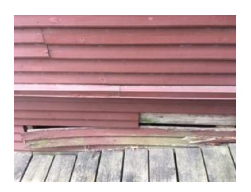
Dixie's Store Wood rot