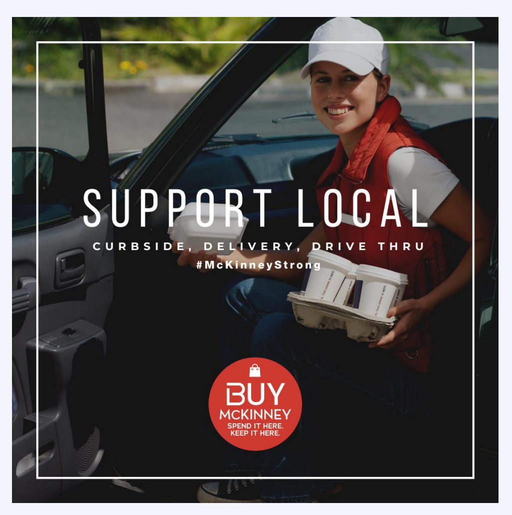
Social Media graphic