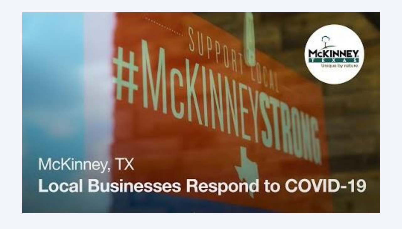
Buy Local community support video