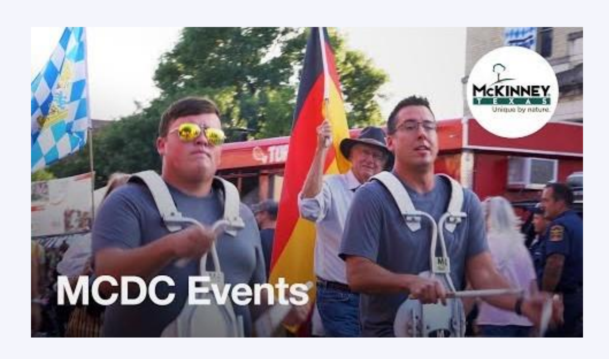
Buy Local educational videos for social media